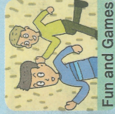
Fun and Games