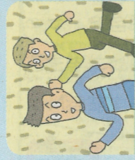
Fun and Games