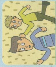
Fun and Games